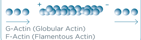
Fig. 3 SMA-T antibody reacts with 'actin cables' (6nm microfilament bundles)